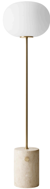
Travertine, Brushed Brass 1840619